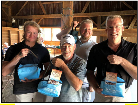
FUN! Crazy Team Attire Prize Awarded FUN Choose a theme and dress accordingly. Traditional. Patriotic. Goofy. And more. Be Creative and have fun

Saturday, September 28, 2024 8:30 am Registration & Driving Range 9:00 am Shotgun Start